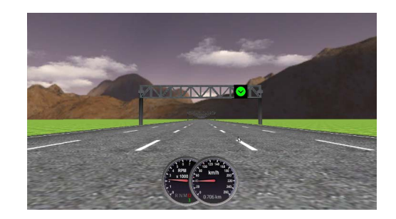
Figure 3: Driver's view from the OpenDS driving simulator [http://www.opends.eu].

http://www.maltparser.org and http://mary.dfki.de.